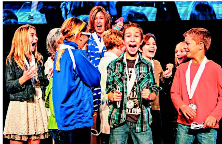
Mason's team reacts as they learn they have won the grand prize at the awards ceremony.